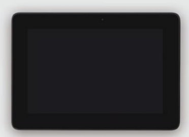
Main Device $30853-H4001-R101